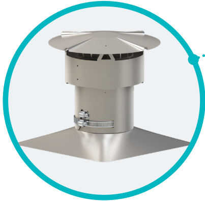
Z-Max Rain Cap and Top Support Flashing

Smoothcore Triple Lock ® Liner eliminates turbulence inherent with corrugated liners, improving draft. Resists corrosive attack by not impeding the flow of condensate down the liner. Less opportunity for soot to accumulate.