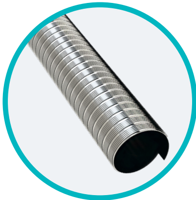
Triple Lock ® Liner