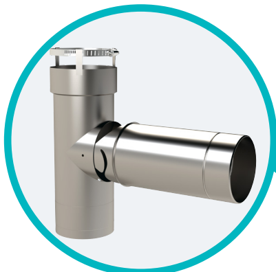
Z-Lok ® Tee