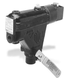
Model 67-LQHU (without quick hook-up fittings)