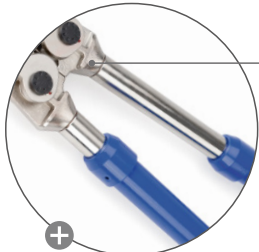
Extendable handles bring more power for copper pressing