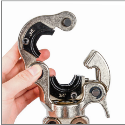
Simple to change jaws