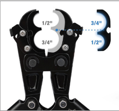
EXCHANGEABLE CRIMP HEAD