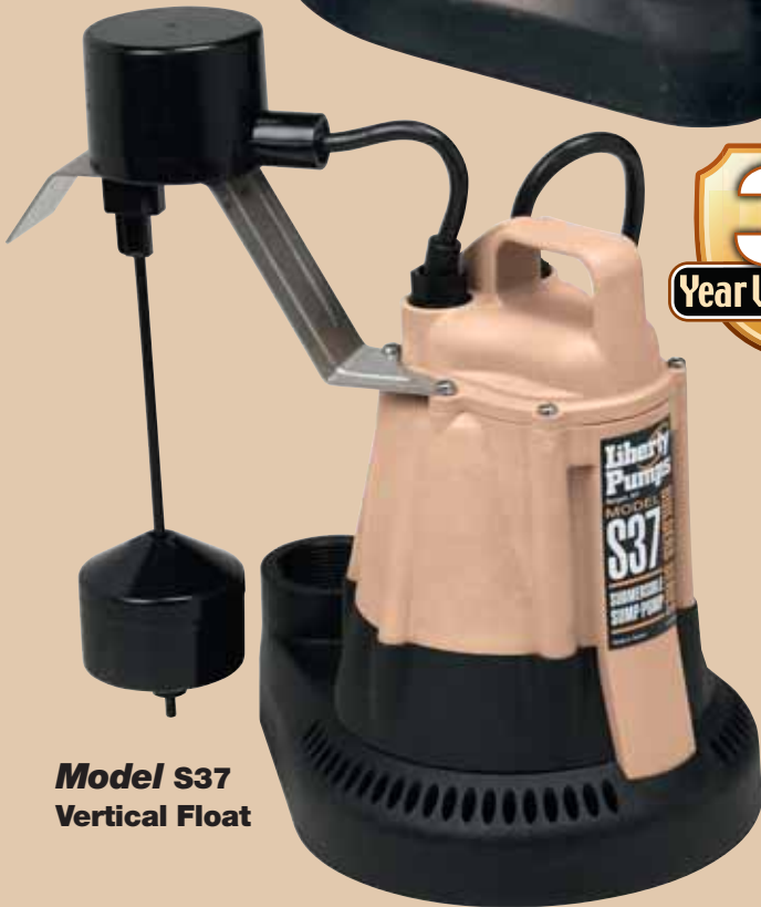
Model S37 Vertical Float