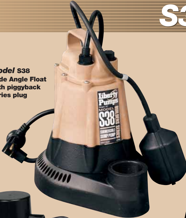
Model S38 Wide Angle Float with piggyback series plug